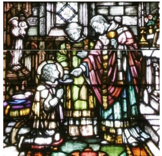
Young Francis de Sales receives his First Communion (Can you find this window in our church?)