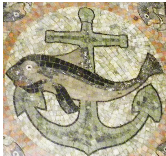
The anchor is a symbol of hope. This anchor mosaic is in the floor of our MBS Chapel.